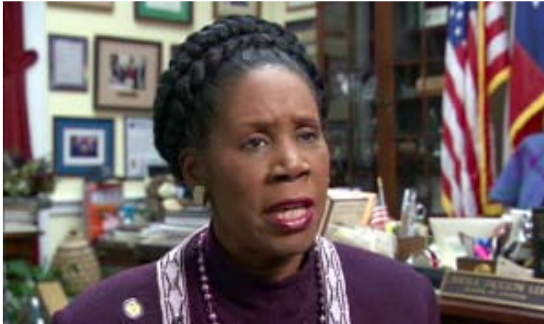
Congresswoman Sheila Jackson Lee says the Bankruptcy Reform Bill is an "atrocious".