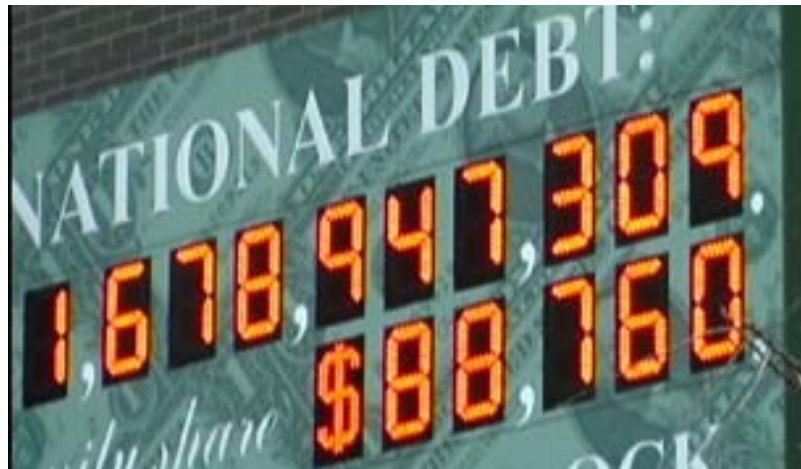
Racking up the nation's bills: The National Debt Clock in New York's Times Square.

his personal experience with bankruptcy. We also hear the story of what happened when actor Lorraine Bracco ("The Sopranos") went into bankruptcy.