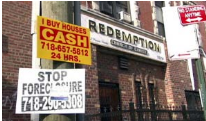
Phony foreclosure counselors in Bedford Stuyvesant, Brooklyn, help defraud homeowners.

into what a former economist of a major bank calls "modern serfdom." Following the lead of a government with a multi-trillion dollar national debt (a large amount in obligations to Communist China), consumers have also racked up trillions in loans, mortgages and credit card debt. For the first time in our history, America has a negative savings rate and buys more from overseas than it produces.