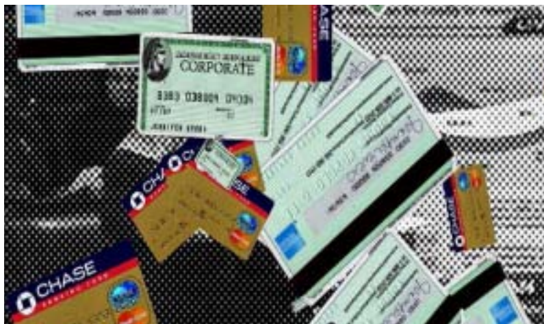
Our prison walls.

all of them but IN DEBT WE TRUST is different because it doesn't just document suffering, it warns of the implications of consequences that will affect all of us. Perhaps that's why this issue cuts across party and partisan lines in a way that can potentially unite a nation. Perhaps that's why mostly everyone I've told about the film tells me how they've come to be personally ensnared in the debt trap.