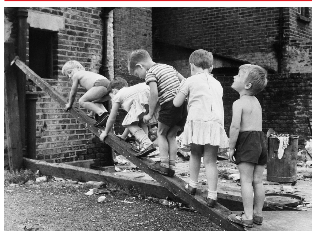
Balham, London, circa 1961