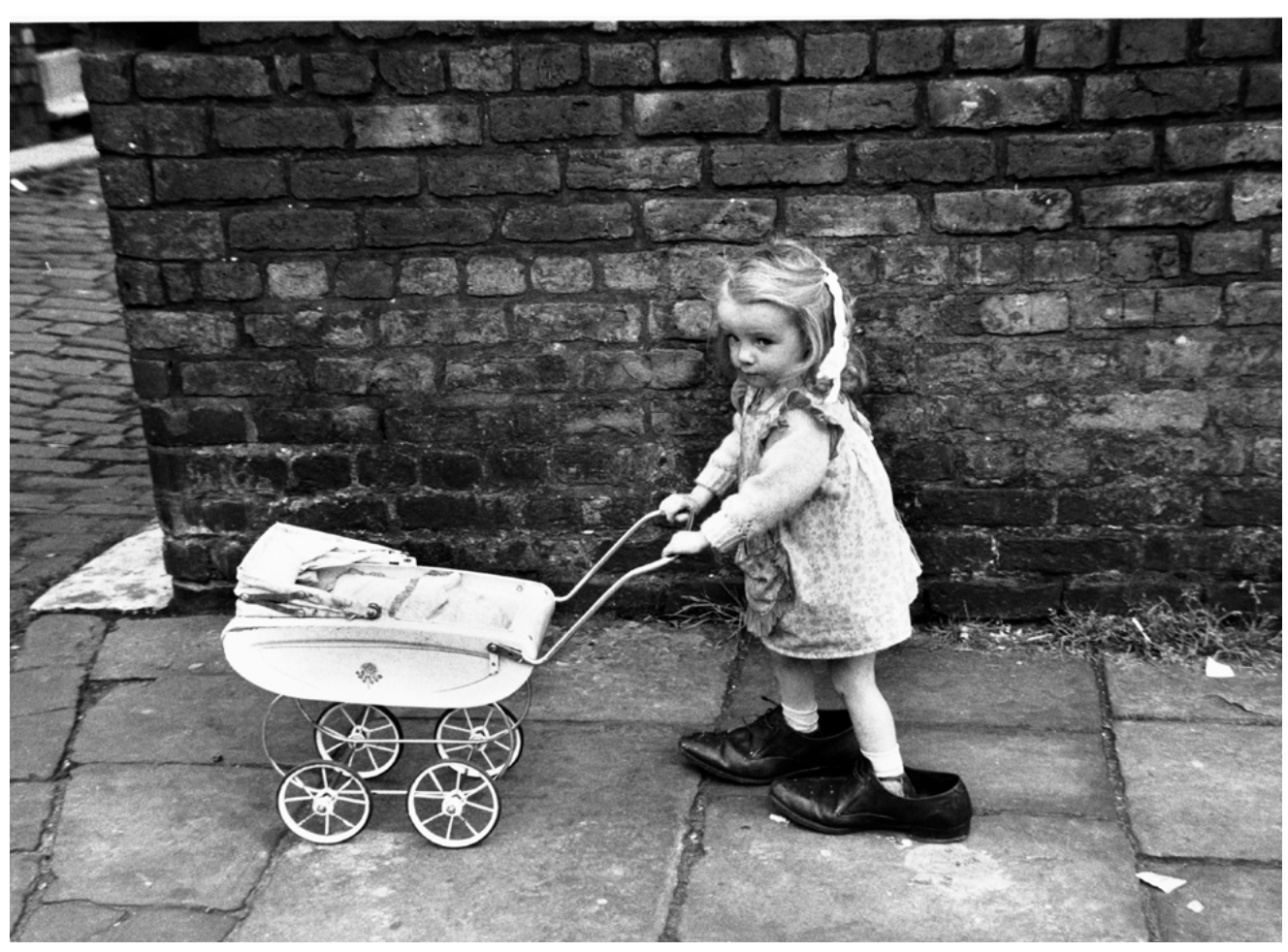
Manchester, 1966

end of World War II, before the avaricious masters of neoliberal capitalism turned their dreams into nightmares: parents trapped in a spiral of never-ending debt, the future of their children first arrested, then driven backwards by low-paying jobs, gravity-defying rents and unaffordable mortgages.