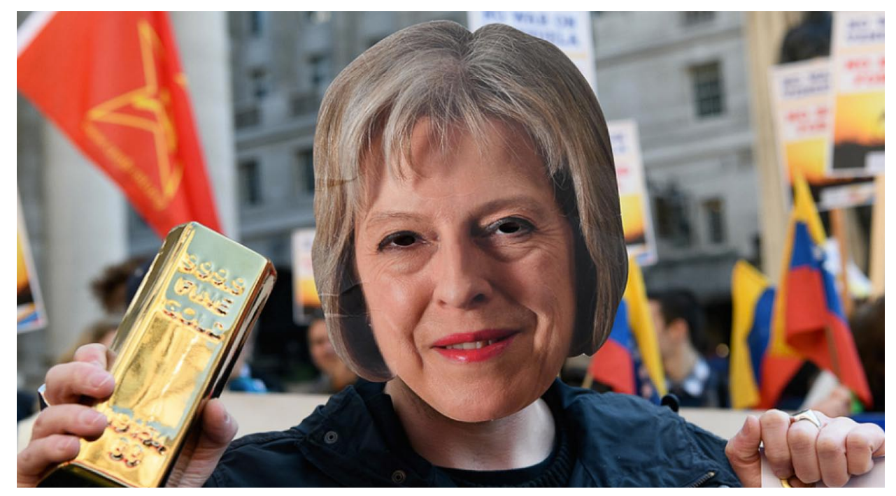
A man wearing a mask of UK Prime Minister Theresa May holds a bar of gold outside the Bank of England during a protest by the Venezuela Solidarity Campaign and Stop the War Coalition that called for the return of Venezuela's gold, which has been seized by the bank.

cessors and by those who today live far from the barrios, in the mansions and penthouses of East Caracas, who commute to Miami where their banks are and who regard themselves as "white". They are the powerful core of what the media calls "the opposition".