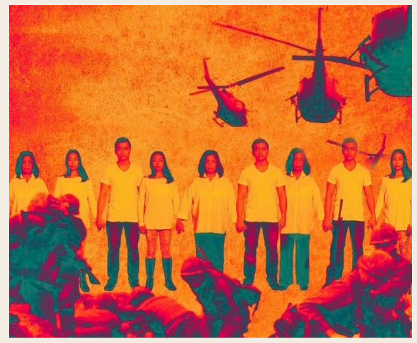
The cast of the play, The Trial of the Catonsville Nine.