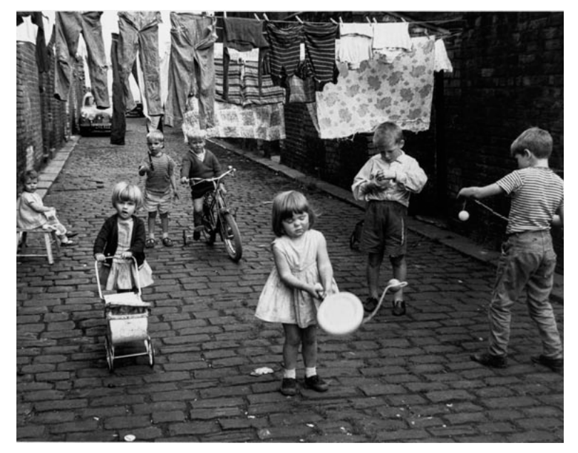
Chorlton-on-Medlock, Manchester, 1966.