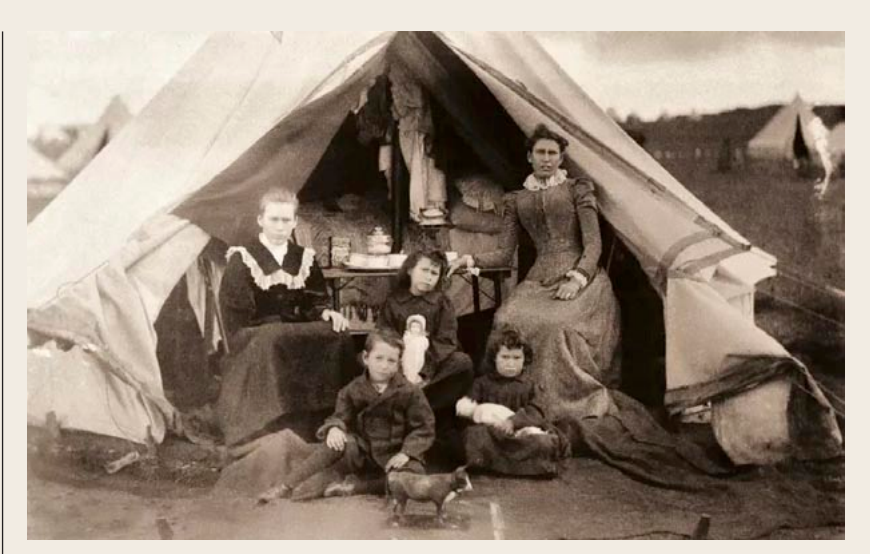
Inside one of the British concentration camps. Photographical Collection Anglo-Boer War Museum, Bloemfontein SA.