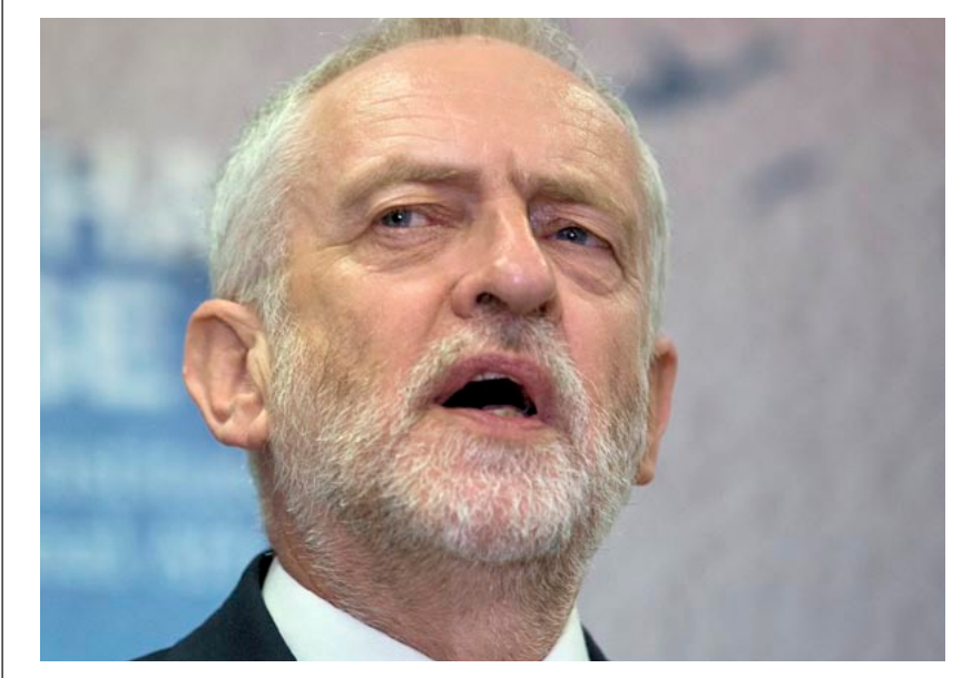
A Labour Party led by Jeremy Corbyn will never be tolerated by a fanatical pro-Israel organisation like the Jewish Labour Movement.

woman show about her treatment at the hands of the Labour party bureaucracy – framed in the context of decades of racist treatment of black people in the west – called The Lynching .