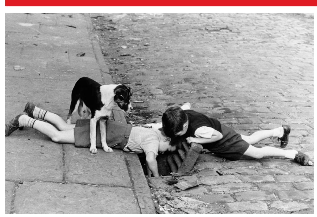
Manchester, 1963

the 21st-century generation, who are reported to be addicted to phones and games consoles, spend most of their waking hours indoors, and whose diet of