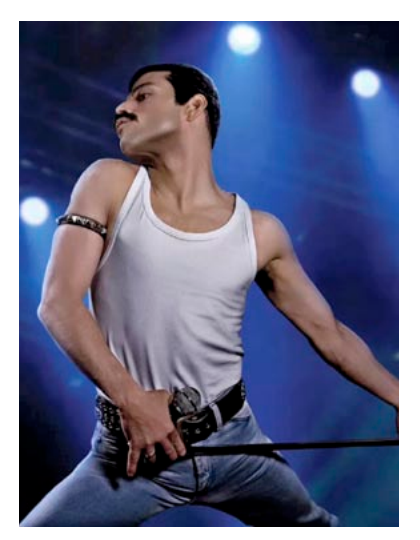
Rami Malek plays Freddie Mercury in Bohemian Rhapsody .

The Village People were unique because they were unabashedly out and proud, but they weren't a hit act because