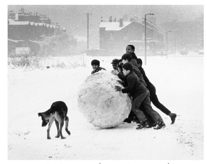
Manchester, 1968.

In those days, before streets were clogged with the screeching hostility of revving car engines, children spent their time outside. "Kids of the seventies might have raced on bikes round cul-de-sacs, or clattered along pavements on roller