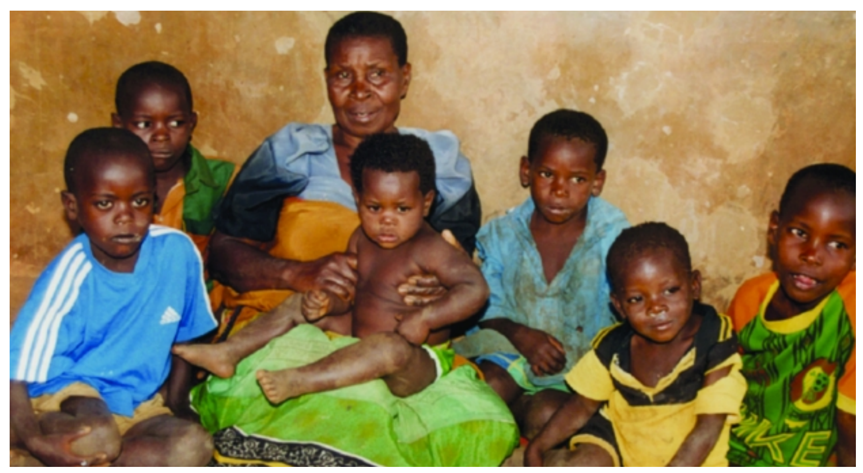
JOY OR AGONY: CHOGM needs to deal with the HIV/AIDS pandemic that has left grandmothers raising their grandchildren