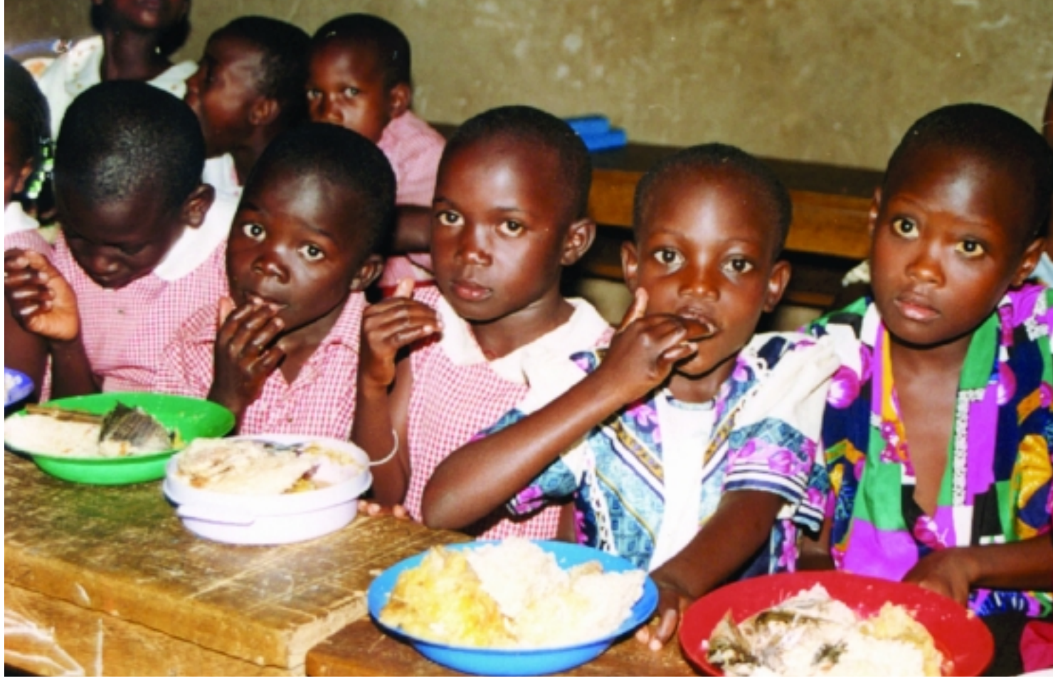
SOLUTION: All eyes on commonwealth heads of government to come up with realistic strategies to halve poverty by year 2015