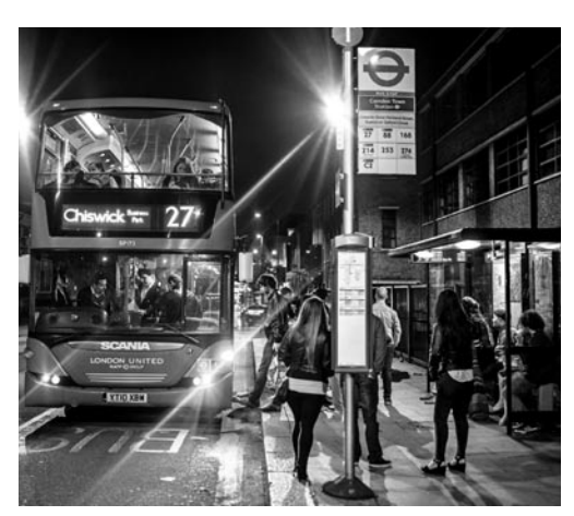
Top: Camden has bars and clubs to suit all needs. However, the one common link is the need for cash

Back on the street, I wonder, "Now what should we do?"