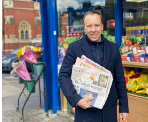
OUTRAGEOUS!: Matt Hancock, the UK's health minister tweeted this picture of himself with an armful of right-wing newspapers under his arm after the ER action.

He continued: ‘Every person who works on News International or a Mail newspaper knows what story is or isn’t acceptable for their bosses. And their bosses