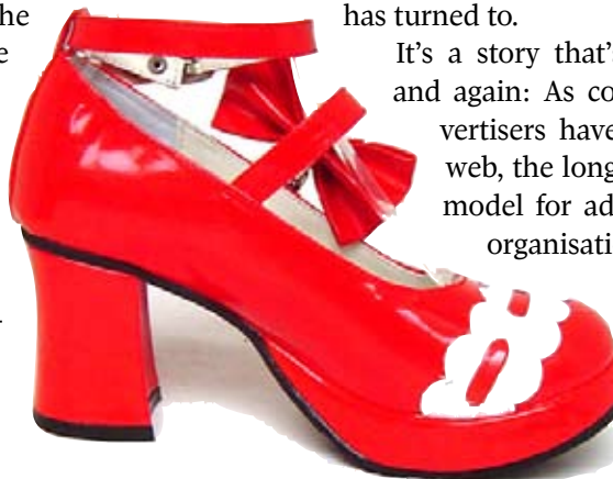
Right: Lolita shoes.