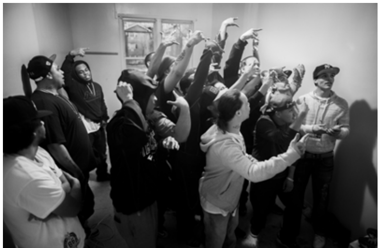
Democracy in action: The Latin Kings meet at their headquarters.

So the 20-year-old photojournalism student began his multi-year effort – inspired by the work of one of his teachers at a New York college – by developing a phantom project, People Living In Their Neighborhoods , interviewing and photographing residents “as a cover to enable me to hang out around the housing proj-