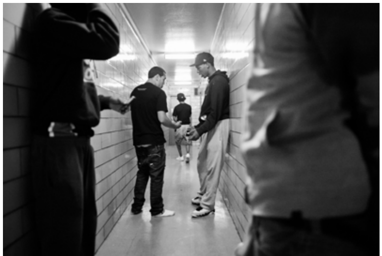
Making a buck: Drug dealing to the local community is the main source of income for the gang.