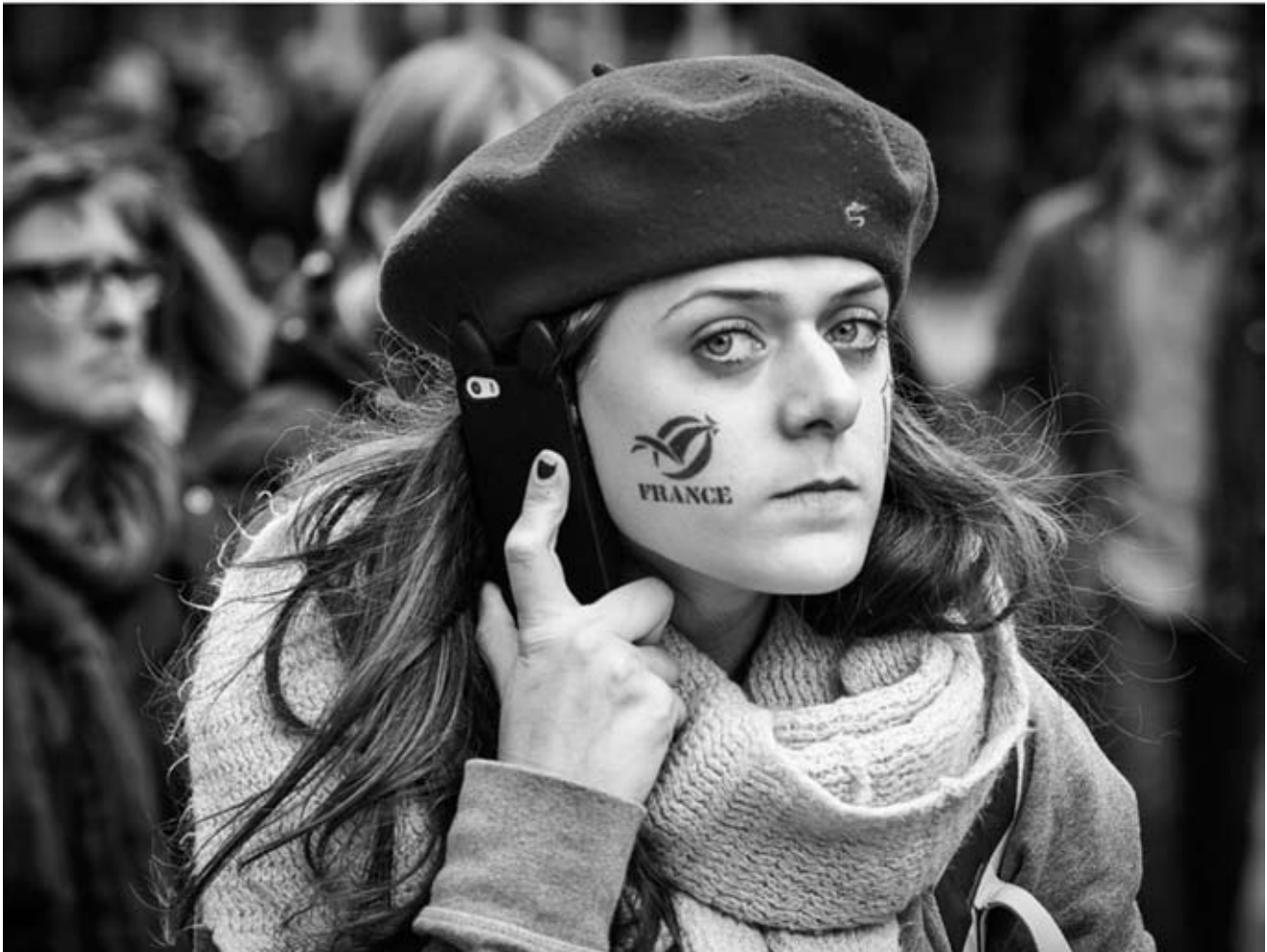
Viva la France: Excuse me, I'm on the phone . . .