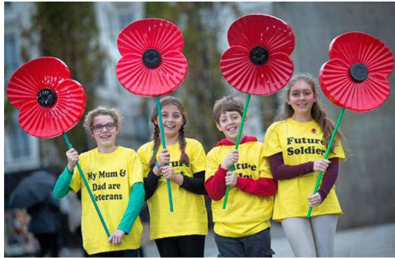
War games: British Legion photograph of children wearing 'Future Soldier' T-shirts caused a storm of protest on Twitter.

These days you are not making a gesture wearing a poppy on a television chat show or a football field. You are making a gesture if you don't.