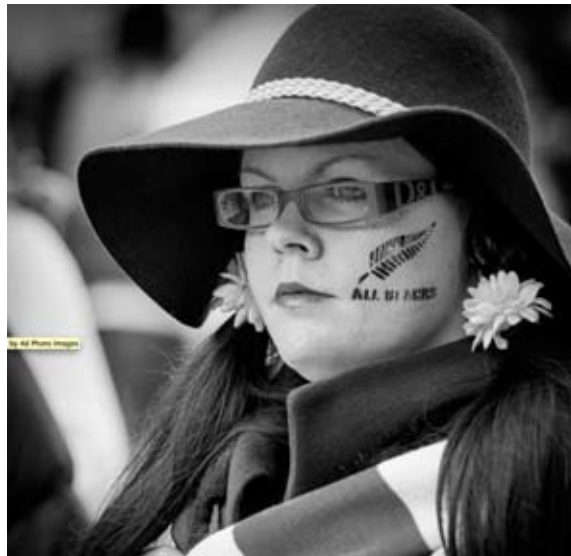
Confident: New Zealand supporter . . .