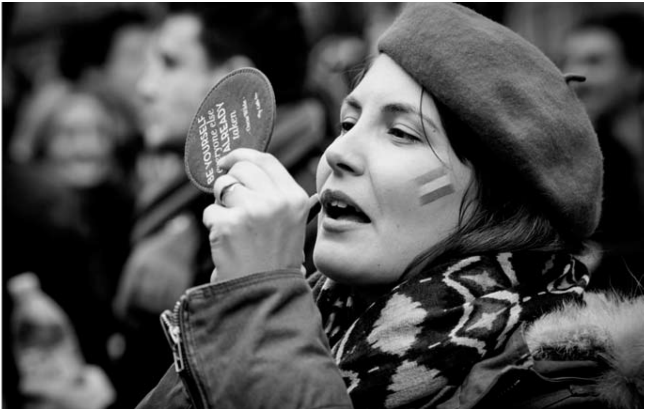
Be yourself: Tricolor on her cheek, this lady gets ready for the big game . . .