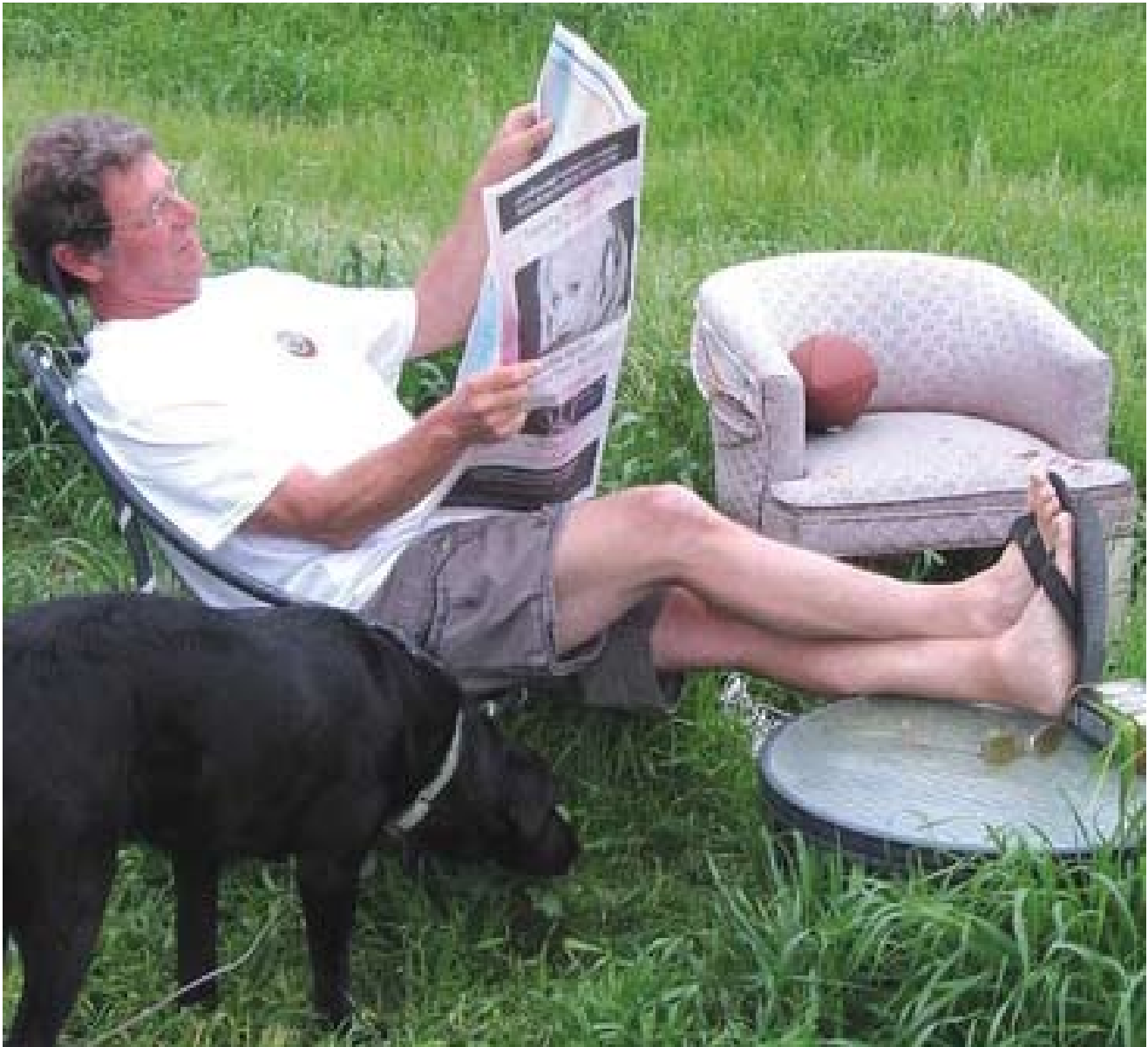
The author, with Marley, his retriever, who would – until he died – swim half way to Catalina to fetch a ball. He was attacked on three occasions by pit bulls and beat their asses into submission.

a firm disbeliever, especially when I went to work in dad’s wholesale rubber and shoe business when I was 12. I listened all day to their tales of deals and investments. Worst of all was hearing of their need to work harder than the next guy and their declaration that anybody not up to their standards was a “lazy bum” and an anchor on the system THEY were supporting.