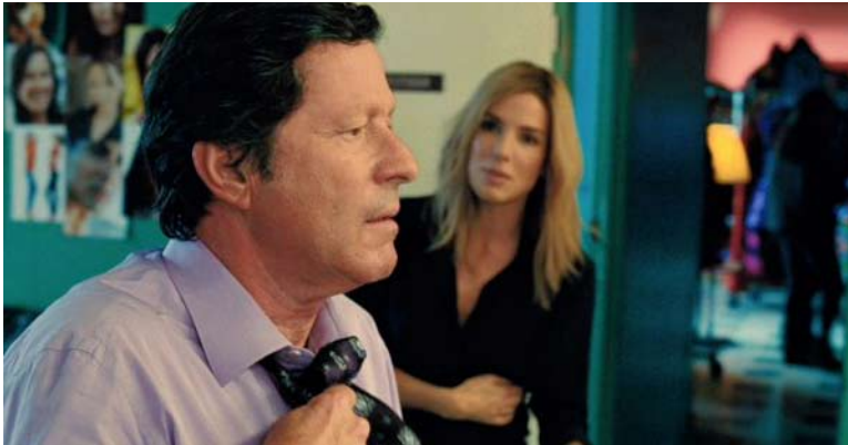
Our Brand Is Crisis