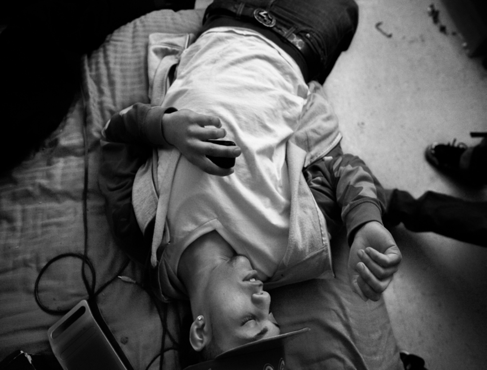
Flash chills out. It seems much of the life of the Latin Kings life is devoted to hanging out and smoking.