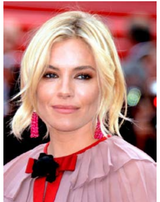
Sienna Miller: No poppy

Last year ITV News presenter Charlene White felt compelled to issue a statement explaining that her decision not to wear a poppy on air didn't imply disrespect for the dead of World War I.