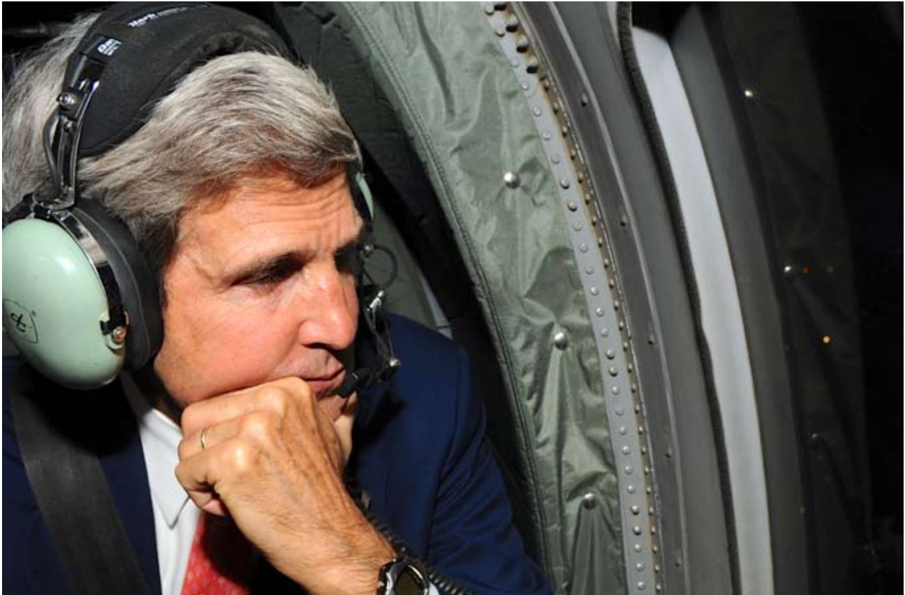
Pondering the future: US Secretary of State John Kerry on an army helicopter following a visit to Afghanistan.

like those in Kunduz, every day under threat of death. I think of fearless Afghan women across the country – activists, parliamentarians, doctors, teachers, organizers, police officers, actresses, TV presenters, singers, radio broadcasters, journalists, government ministers, provincial officials, candidates for public office – who over the last 10 years have been assassinated one by one, by teams of armed men on motorcycles, or by a bomb attached to the underside of a car, or by masked squads with ropes or Kalashnikovs. These killings have gone on year after year, the names of the dead women remembered and their numbers tallied by Human Rights Watch, while the Afghan government and the Bush or Obama administrations uttered scarcely a word of protest or condolence, and Afghan police failed to arrest a single assassin. George W. Bush famously claimed to have “liberated” Afghan women.