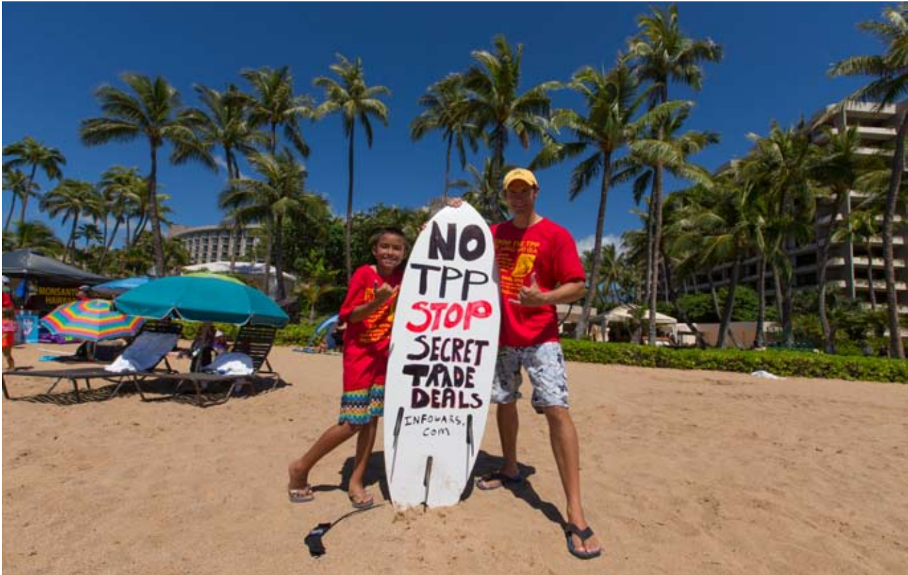
Protesting: July 29, 2015, outside the TPP talks in Maui, Hawaii.