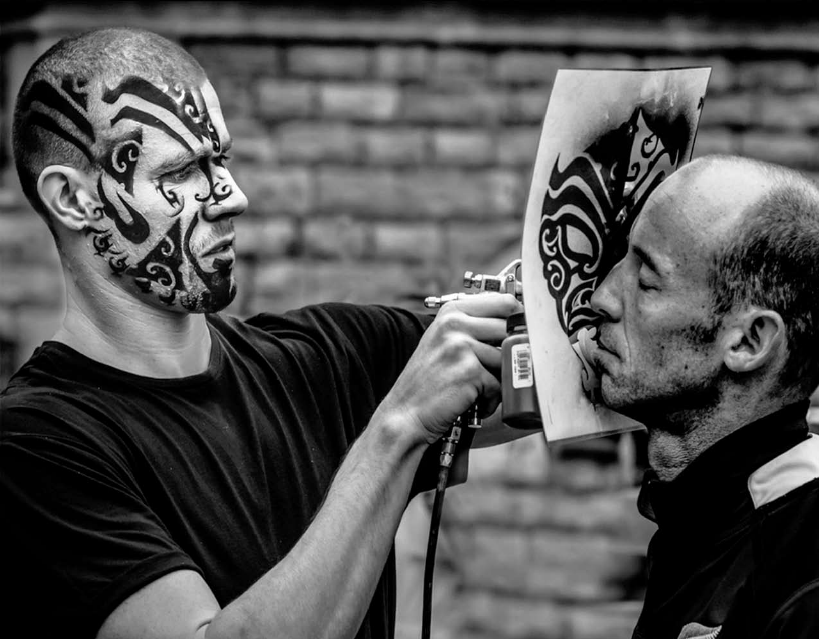
War paint: New Zealand fan closes his eyes as his face is sprayed . . .