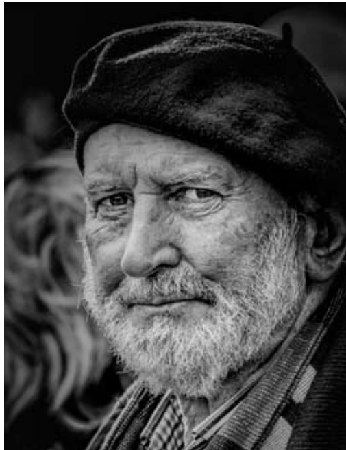
Dour: Frenchman has premonition of defeat . . .