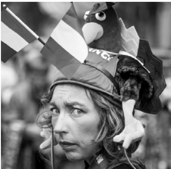
Fowl play: Lady, there's a chicken on your head . . .