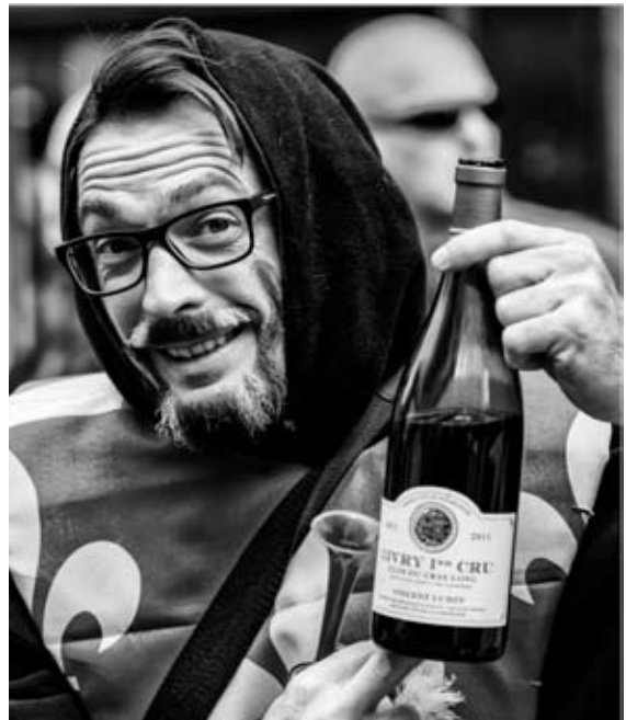
Over-confident: Preparing for a Gallic victory . . .