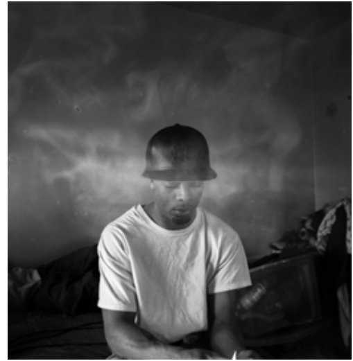
Lost in a cloud of smoke: Smokey lights up a marijuana joint.