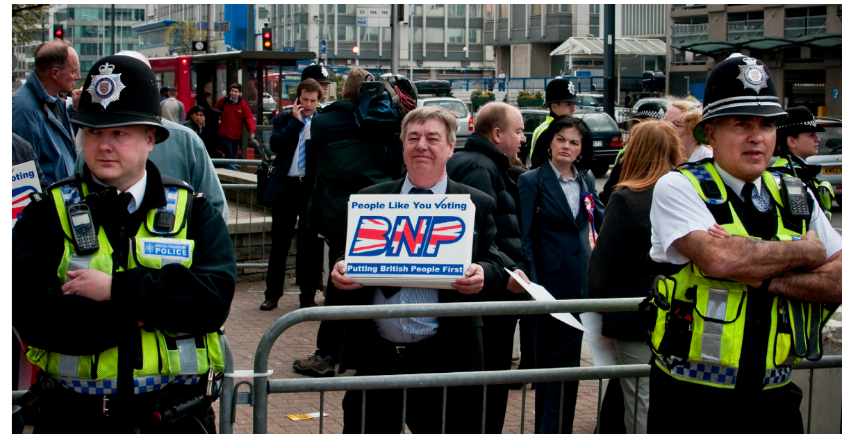
Left: BNP supporters turn out in Croydon to protest against immigration. They end up being vastly outnumbered by anti-fascists, however, and ultimately require police protection