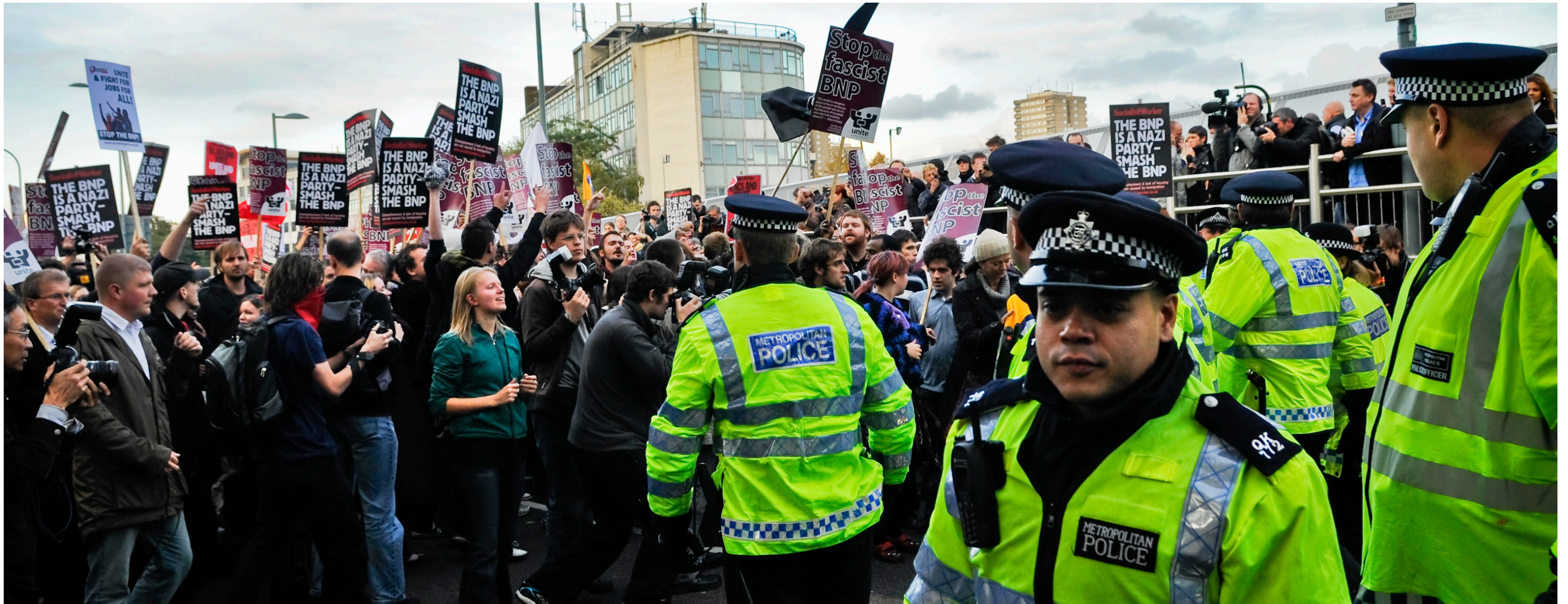
Above: Any appearance by the British National Party in London attracts passionate and organised counter-demonstrations. The BNP are a mainstream political party in the UK despite their openly racist policies

ists who criticise them or simply cover their events are assaulted and have been sent death threats.