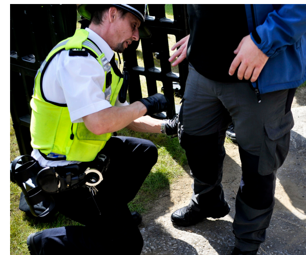
EDL supporters are searched for knives by police before being allowed to attend a rally in Bradford

of other cities and towns. For an organisation that preaches peaceful resistance to the “evil” of Islam violence and public disorder has followed them everywhere they travel. The hypocrisy of the EDL and their supposed anti-evil crusade is unrivaled and they would be a laughable cliché unworthy of attention if their “demonstrations” didn’t attract thousands of racist, violent hooligans.