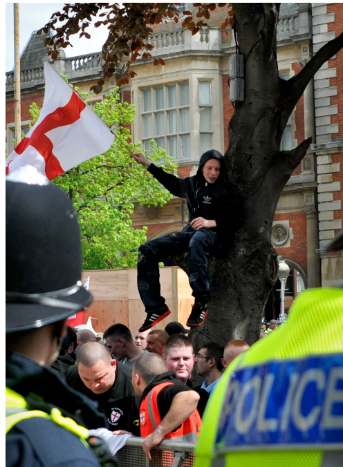
Right: A young EDL supporter waves the English flag over the main square in Ayelsbury. Locals abandoned the town for the day, fearful of the destruction and violence which often follows the EDL