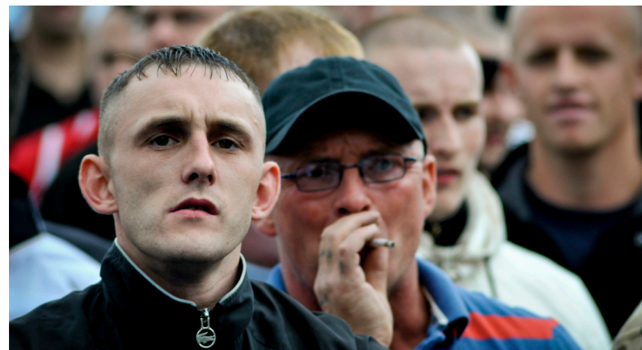
In Summer 2010, English Defence League supporters rallied in various towns across the country