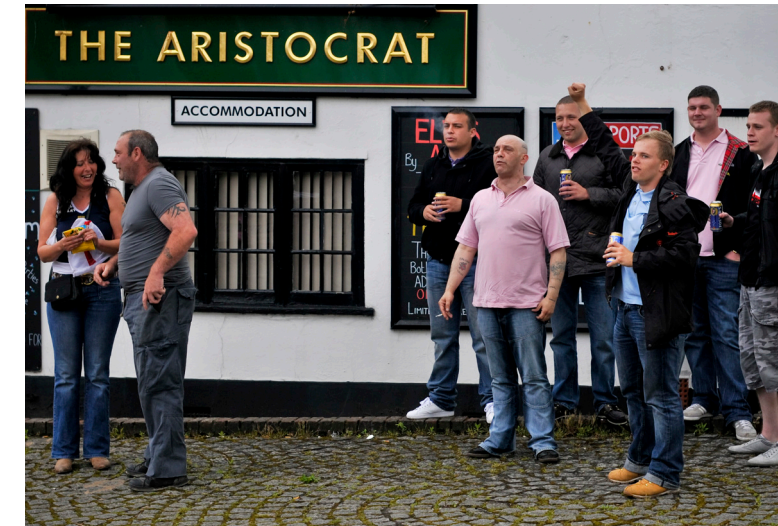
Left: EDL arrive at an almost abandoned Ayelsbury and head straight for the pub.