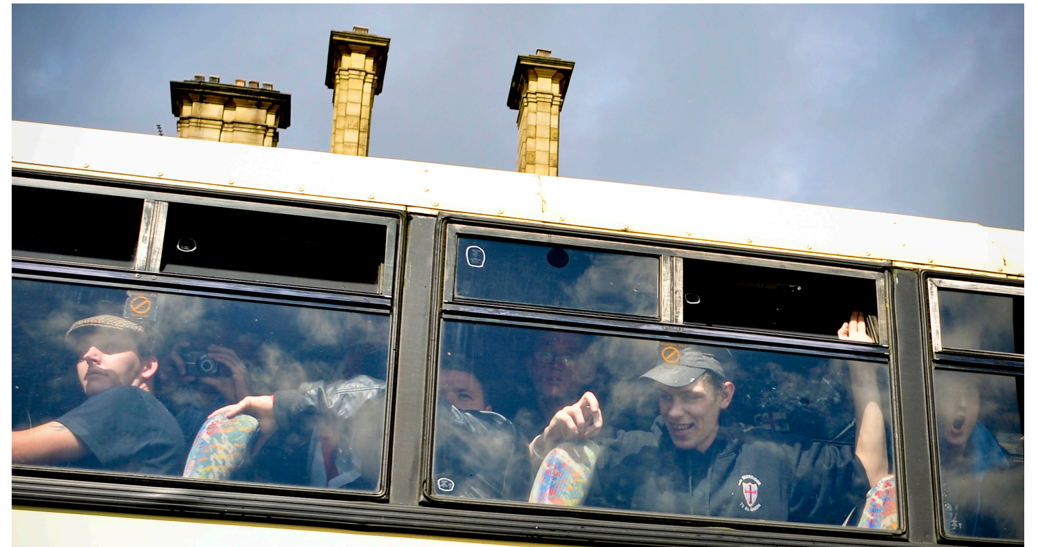
EDL supporters arrive on a chartered coach in Bradford. Towns with high-concentrations of Asians and Muslims are targeted by EDL mobs and their demonstrations almost always descend into violence