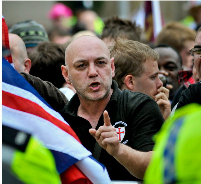
Above: An English Defence League supporter argues with a police officer. The police are often abused by the EDL for being unpatriotic