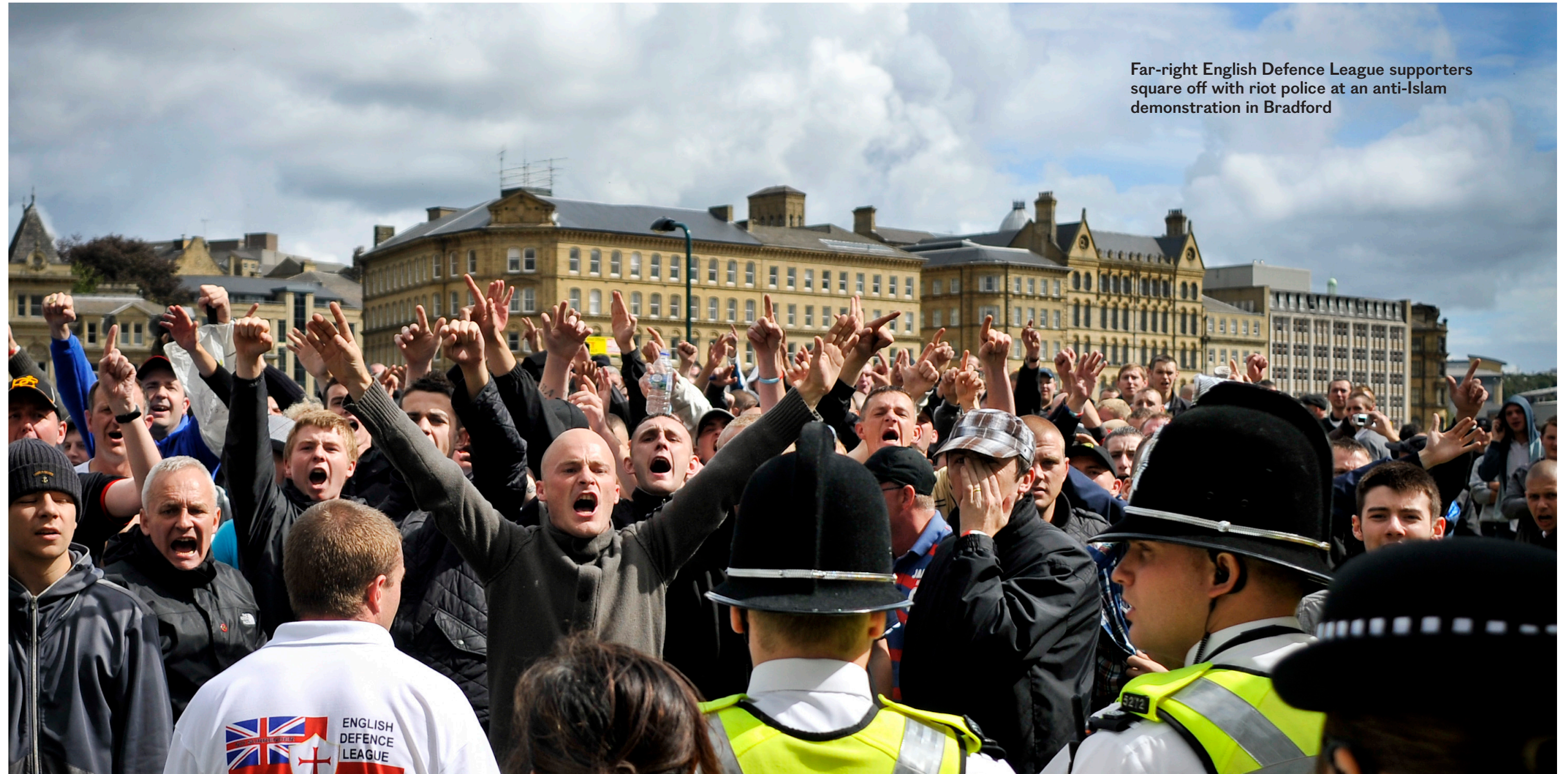
Far-right English Defence League supporters square off with riot police at an anti-Islam demonstration in Bradford

Despite the apparent generosity of this group in Bradford, who decided to throw coins and booze at reporters and local Asians, the somewhat infamous English Defence League are rarely discussed in the context of their charity and philanthropy. Founded under the ideology of “peacefully opposing” what they regard as the “spread of Islamic extremism throughout British society” the EDL have left a wake of blood and destruction across England and they’ve so far clashed with riot police and anti-fascists in London, Bolton, Luton, Ayelsbury, Bradford, Newcastle, Birmingham and dozens