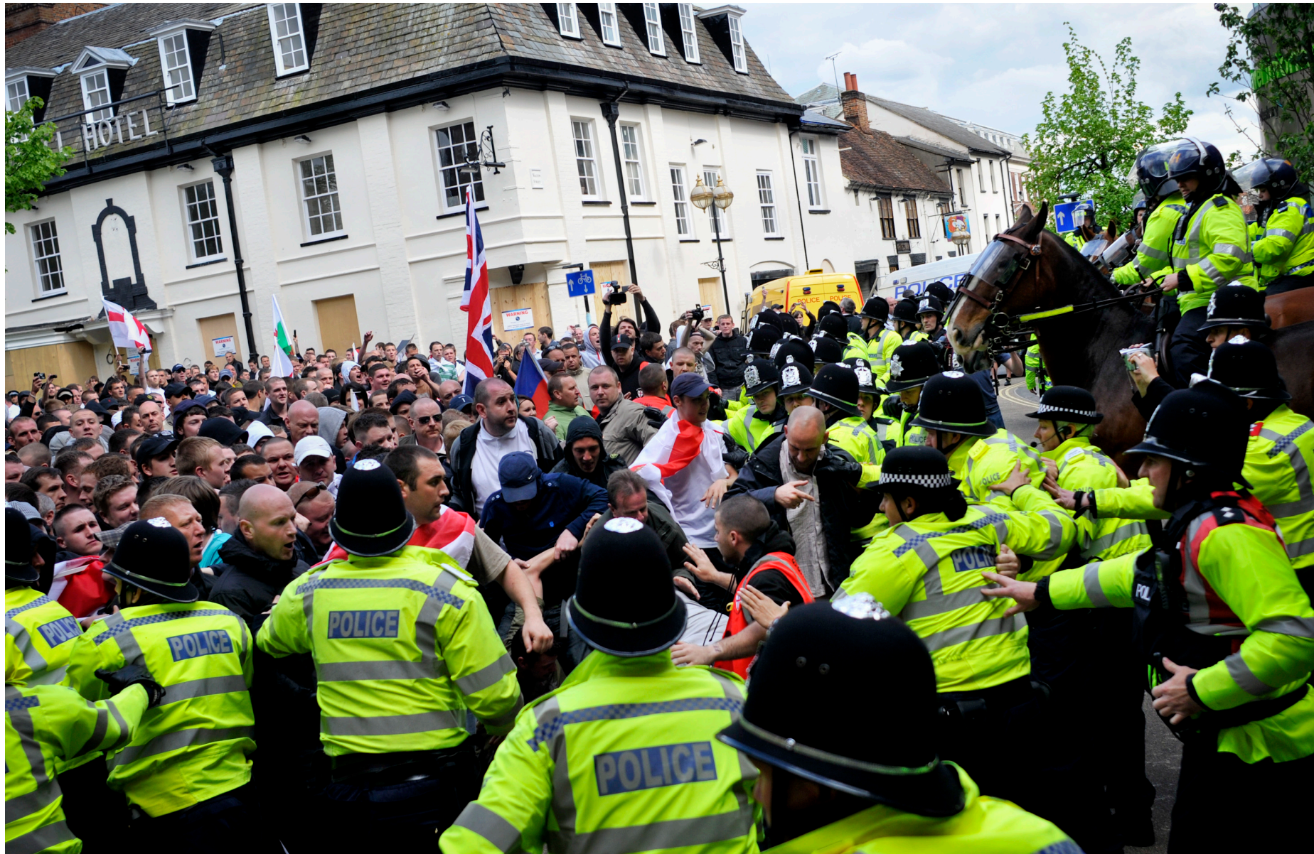
Above: English Defence League supporters, many drunk and violent, attempt to break through police lines in Ayelsbury. Police respond with baton charges and horses to restore order

have been proven to be a particularly big problem in England. It is simply the growing atmosphere of xenophobia, and re-emerging racism in our society. Many EDL members have proven links to fascist organisations such as The National Front and neo-Nazi groups – racist and violent gangs which used to terrorise immigrants and asylum seekers in Britain.