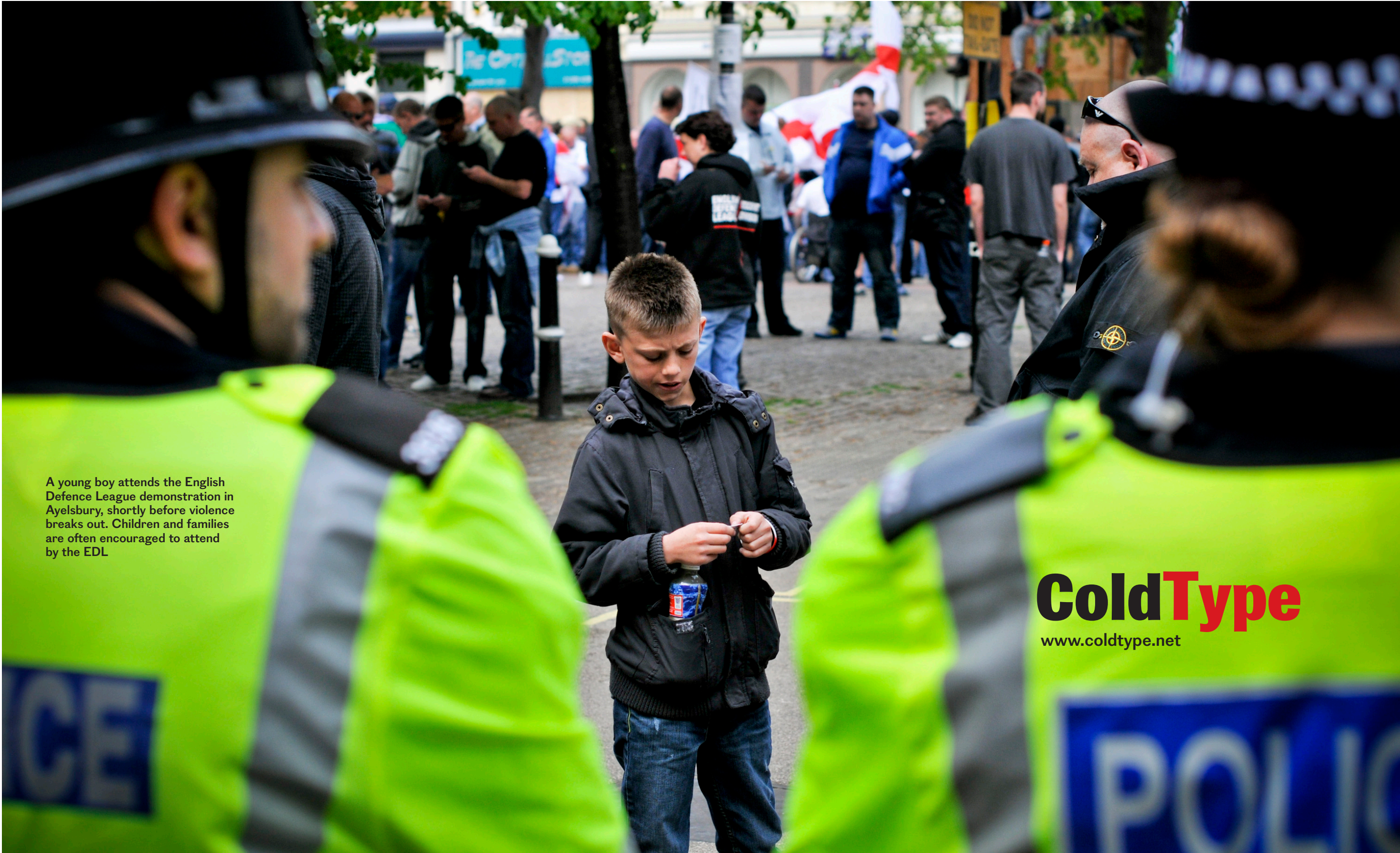
A young boy attends the English Defence League demonstration in Ayelsbury, shortly before violence breaks out. Children and families are often encouraged to attend by the EDL