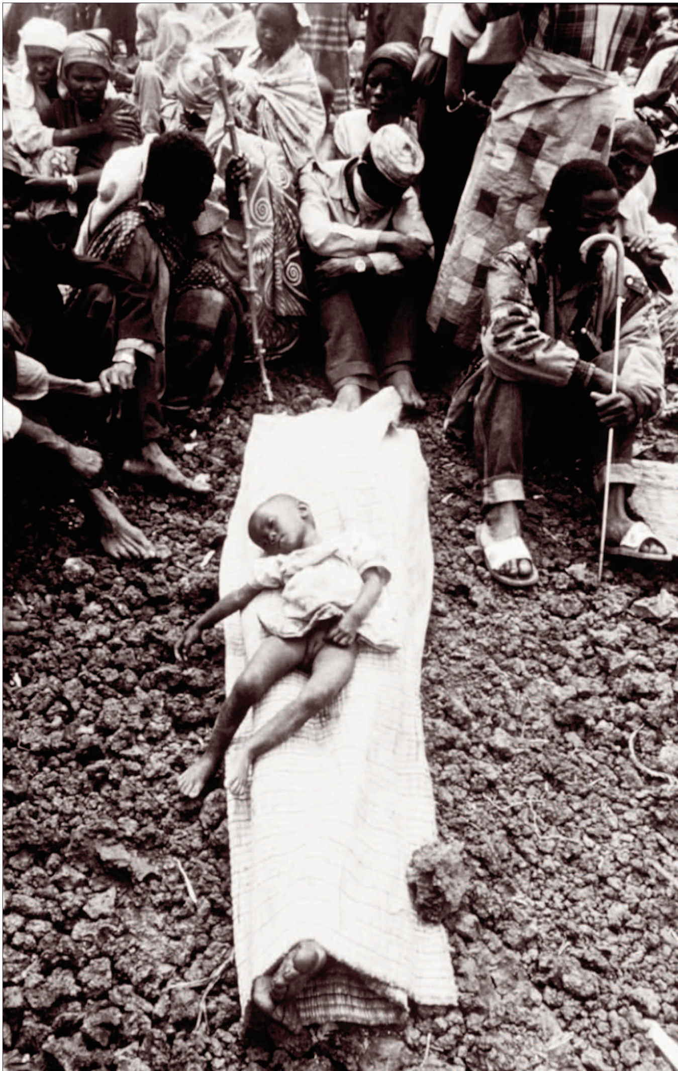
A young girl sprawls across the corpse of her mother at the Miningi cholera camp