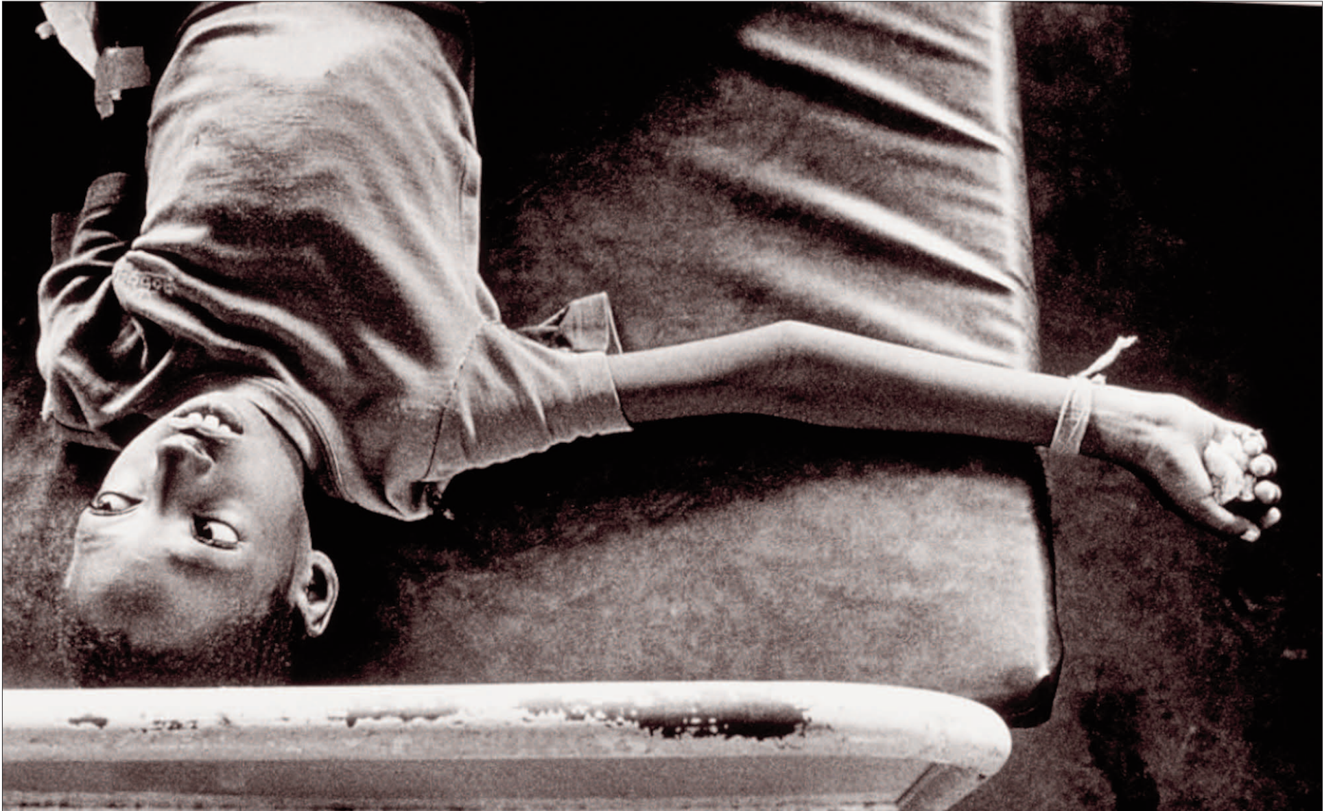
Tutsi boy left orphaned by the Rwandan war lies in a makeshift hospital in Kigali.

“I could see dozens and dozens of bodies ... I could describe what they looked like, but I don't think you want to know what a little girl resembles after she has been hit by mortar fire”