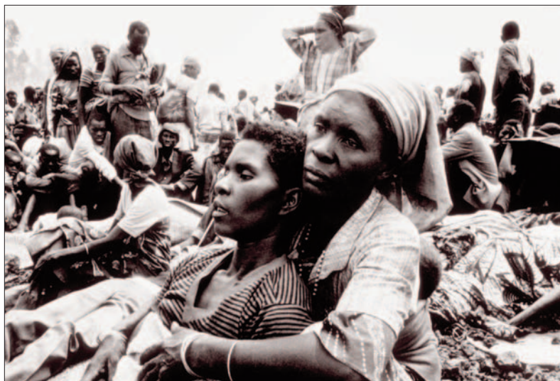
A woman comforts a sick relative at the camp.