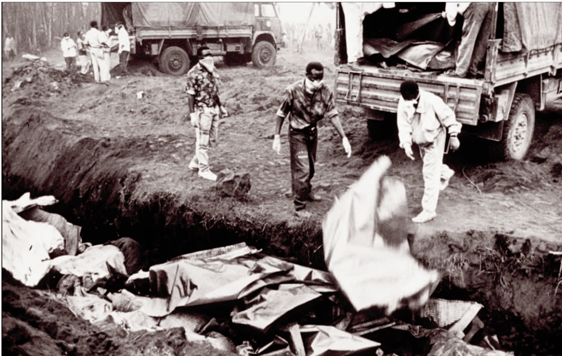
Volunteers toss one of the victims of disease and starvation into a mass grave.

Panicked people were fleeing into the countryside of bordering nations and into foreign towns