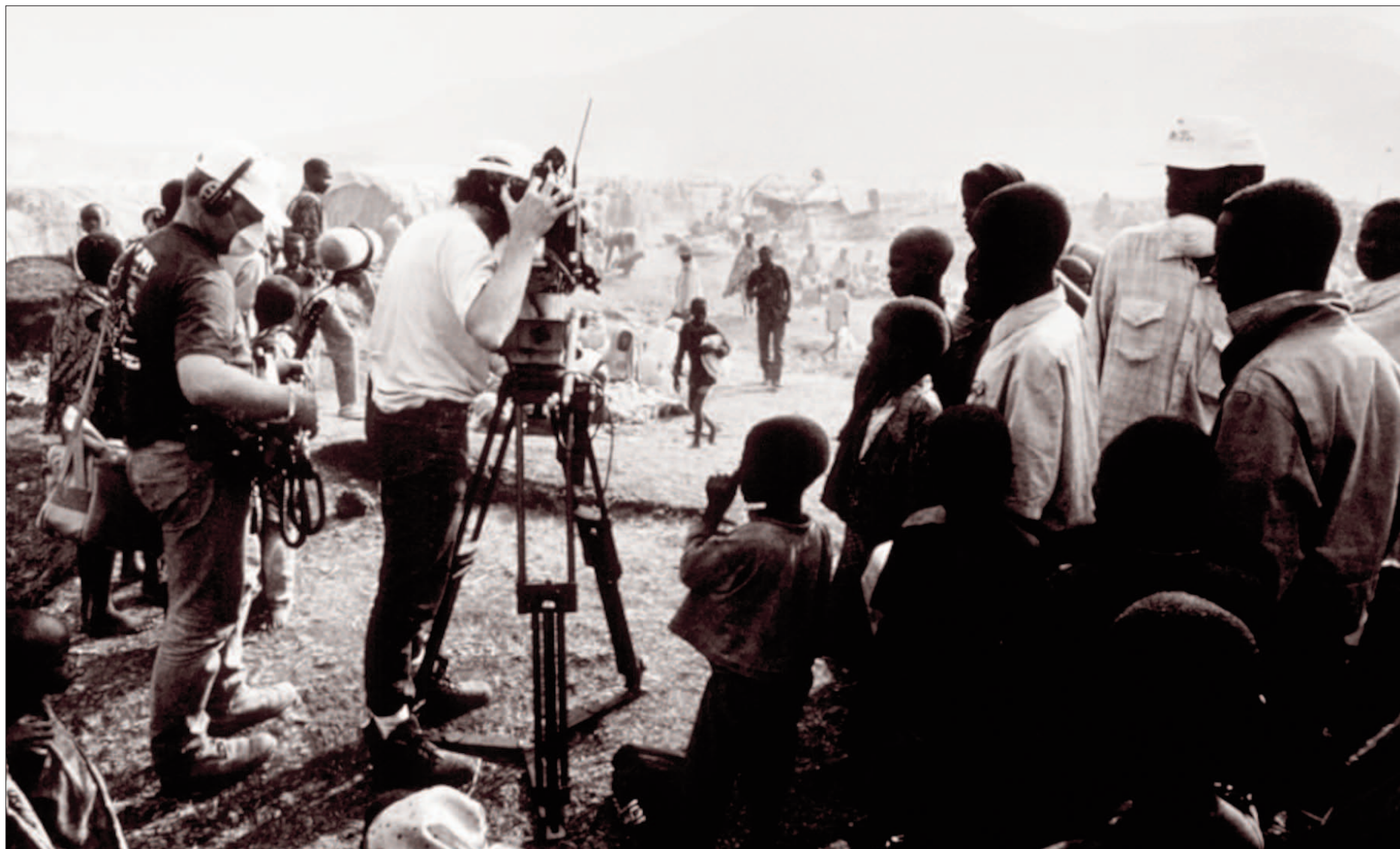
A Swedish TV crew films at the Kabumba refugee camp.