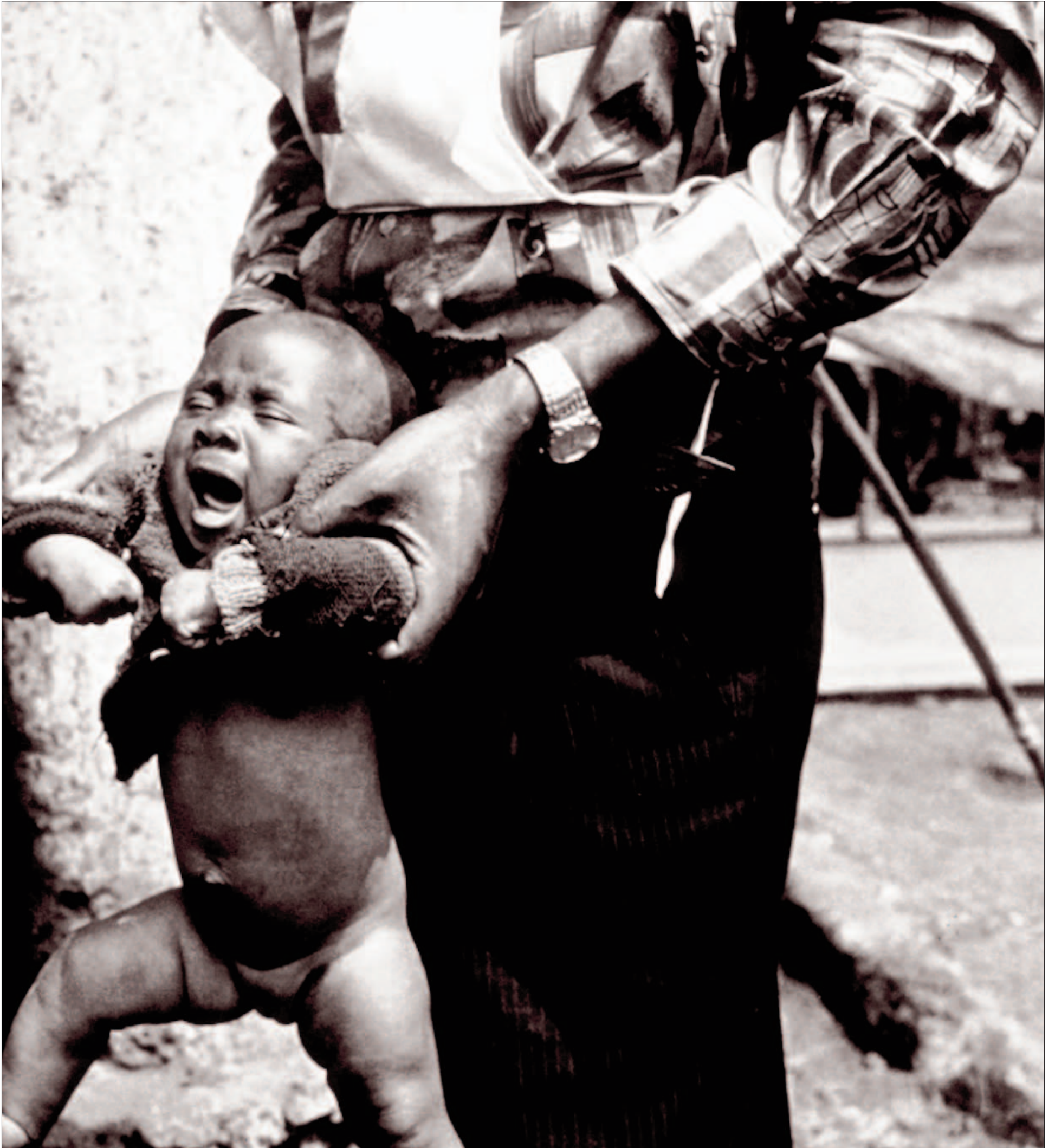
An International Red Cross worker holds a baby girl found among 80 Rwandan refugees trampled to death in Zaire.