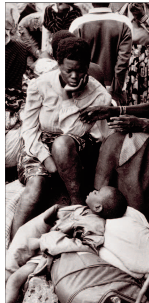
Exhausted and forlorn after walking for miles to get into Zaire, a mother and child slump by the roadside.

This was not my first trip to Goma. Seven years ago I had stayed a few nights in transit as I travelled down through eastern Zaire for a hiking holiday in neighboring Uganda. Goma was a dusty backwater then, with a population of maybe 150,000, and I remember thinking, fat chance it would ever see me again. Now here I was.