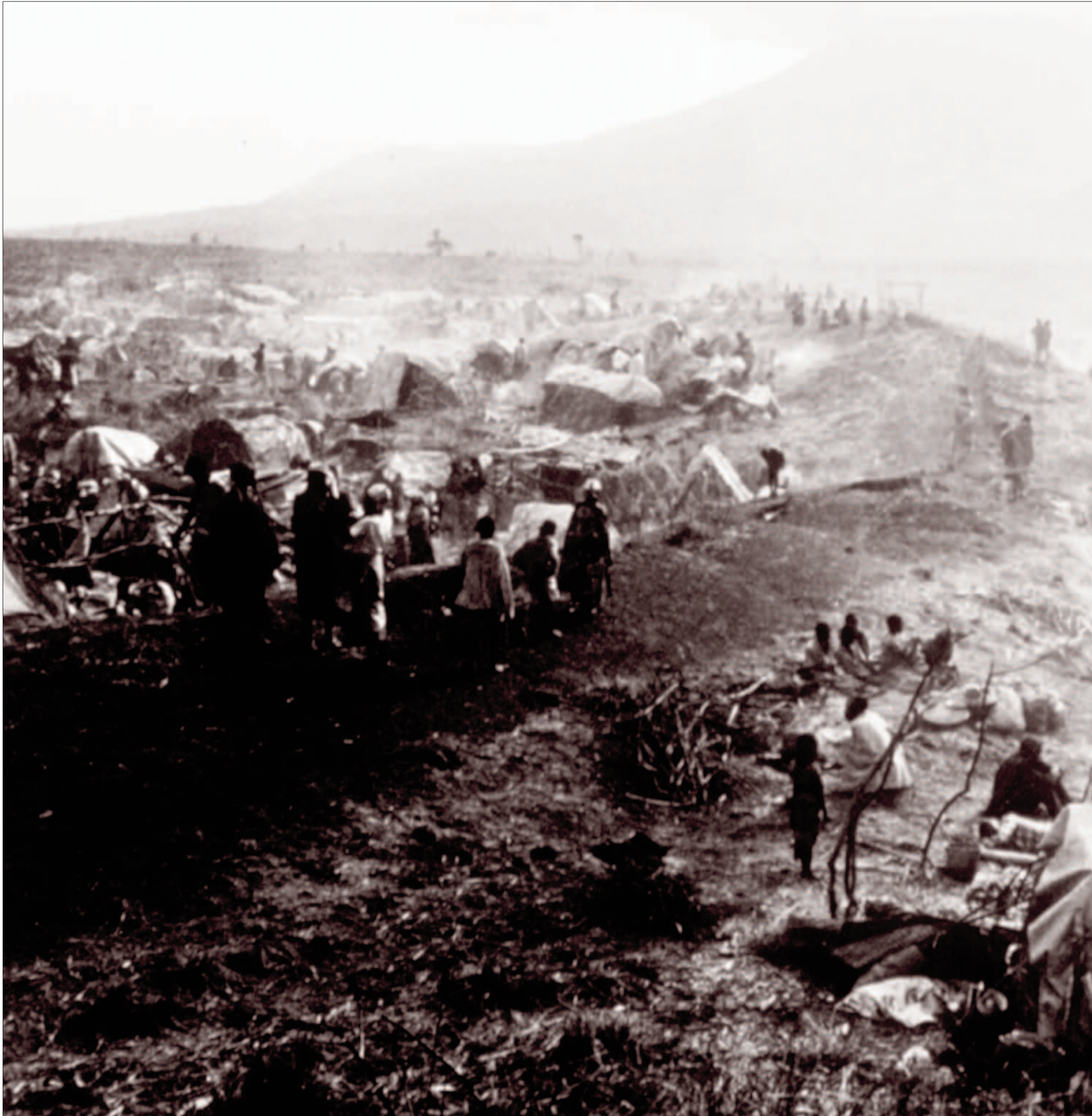
Smoke from hundreds of fires casts a haze over the setting sun at the Kabumba refugee camp, just outside Goma.