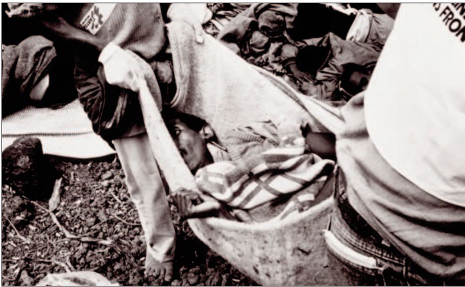
Doctors carry a dying Hutu refugee in the Miningi ‘cholera’ camp outside Goma.

“Please forgive me, I thought, as I raised my camera and moved another step closer”