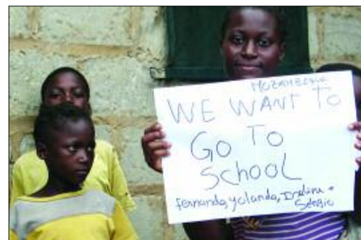
G8 leaders will get some very blunt messages.

family, and eventually managed to get pregnant, but her child became ill, and was diagnosed with HIV. The woman herself then found out she, too, was HIV positive. Her husband was tested and was found to be negative. "So the minute she lost her son, her first child, her husband told her to leave because he could not be with someone who was HIV positive. And when she was telling her story, and you could really feel her pain. But even in that moment of despair, she still knows that she has rights, she still knows that she's entitled to something and that was uplifting. So sad, but uplifting."