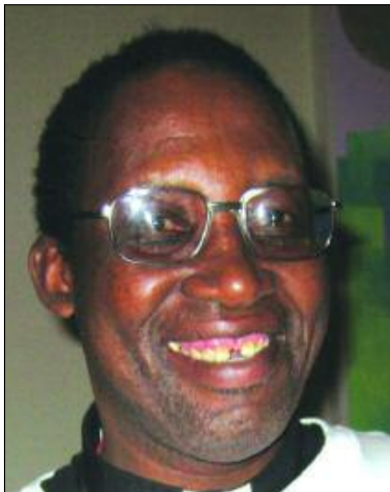
Archbishop Pius Ncube: Vocal critic in Zimbabwe.

Pius – the Catholic Archbishop of Bulawayo – is one of the most vocal figures in Zimbabwe's civil rights movement. Before this year's elections he criticised government officials for using food aid as a political weapon and called for South Africa to cut off electricity supplies to Zimbabwe to make Mugabe hold talks with the opposition. In criticising Mugabe, Ncube has consistently risked his life, and both he and his mother have been threatened with death by the Zimbabwean security service. He has helped to mobilise a multi-denominational church coalition in Zimbabwe.