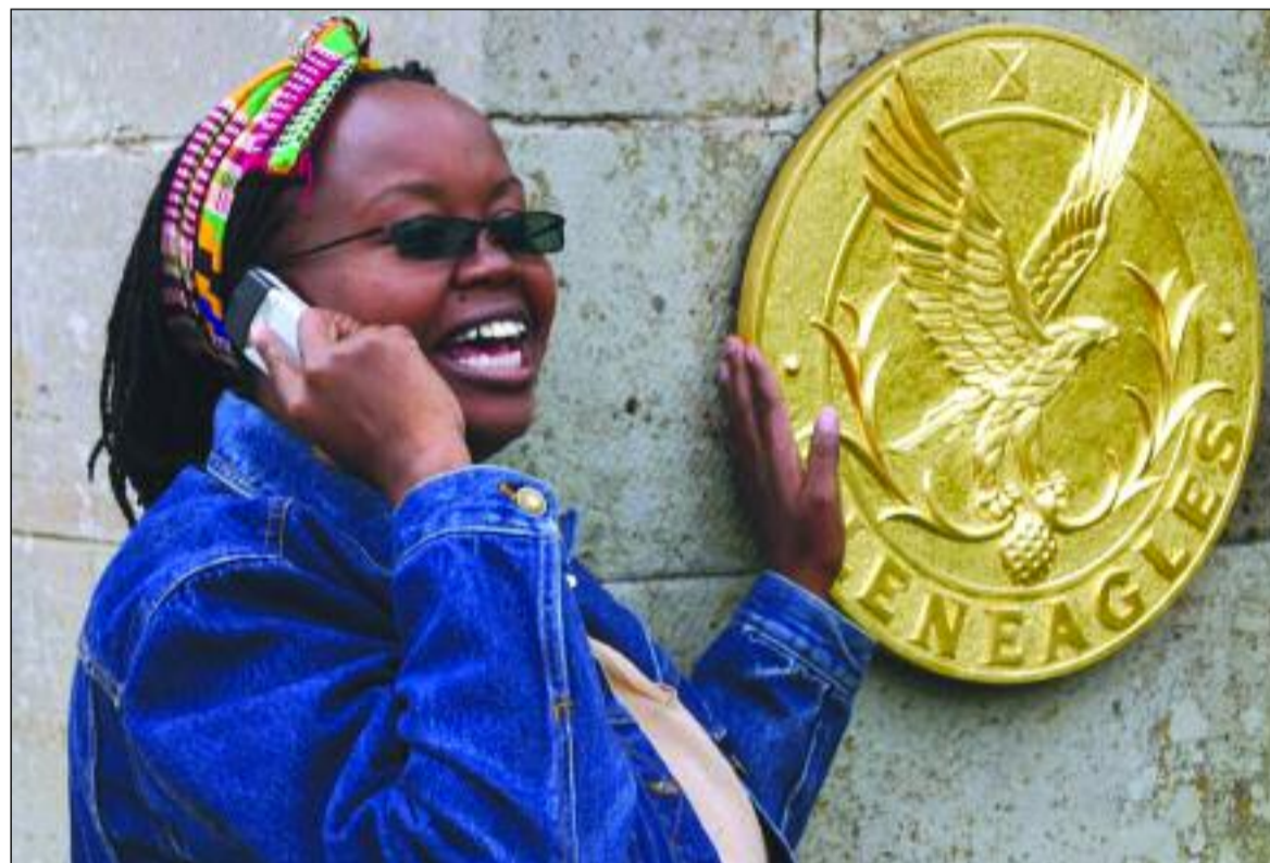
GRACE calls her mum in rural Kenya after sending her e-money African style

Finally, the cell phone was used to mobilize people to get out and vote on the day – and the result?