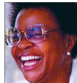
Graca Machel: "Very humble, very human".