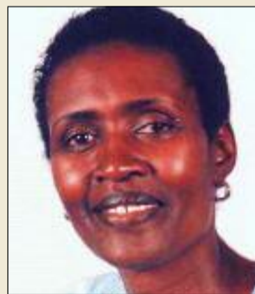
WINNIE BYANYIMA – Women's Director, African Union, likely Presidential candidate, Uganda – Page 12