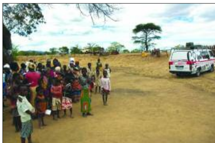
The South African bus sets off on a 3,500 kms journey.