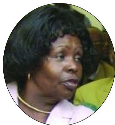
KENYA'S Lucy Kibaki: Slapped photographer

Pressure group, Reporters Without Borders said, “We are stunned that presidents' wives went so far just to seek personal revenge. We therefore call on Lucy Kibaki to apologise to the cameraman she hit and we call on Stella Obasanjo to have the Midwest Herald's publisher released from prison immediately, as