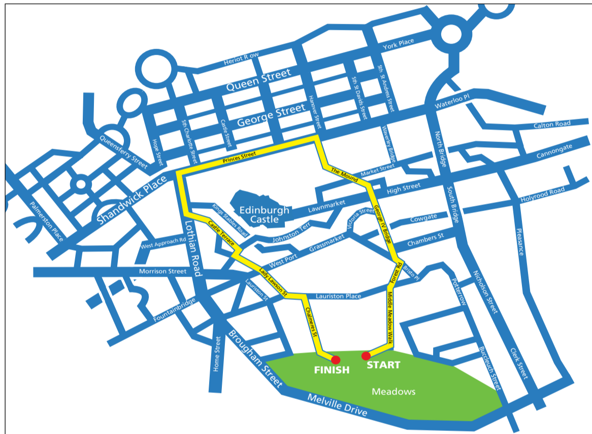
The Make Poverty History March route starts at the Meadows 12 noon July 2nd – be there!

And thanks to many organisers including Edinburgh Council – what a three weeks before that day too! Edinburgh is hosting a programme of G8 events to talk about Africa and encourage public involvement, particularly by young people. The full programme and latest details are available at www.edinburgh.gov.uk/G8Summit and in programmes distributed throughout the city.