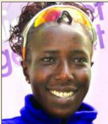
LORNAH KIPLAGAT – World record holder & fundraiser for African girl athletes, Kenya – Page 5