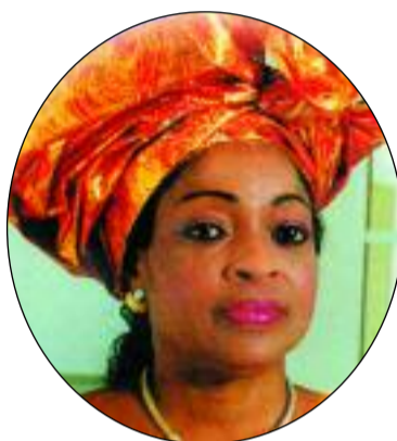
NIGERIA'S Stella Osasanjo: Had publisher arrested.