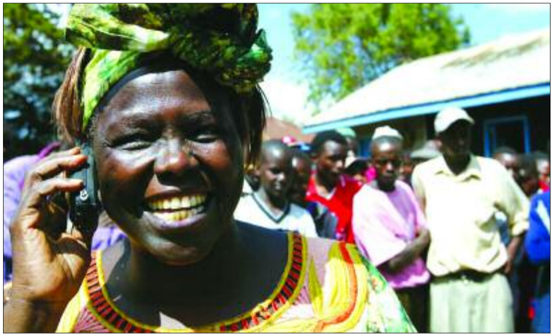
Environmental activist Wangari Maathai speaks on the phone as she is congratulated in Ihururu, Kenya, after she won the Nobel Peace Prize for her work as leader of the Green Belt.

WHEN we got independence, leaders failed to see the lifestyle the colonial administrators were living was exploitative, undemocratic and brought conflicts. In many African countries we talk of the change of guards. But there was not a change of thinking. We changed guards and continued with the lifestyle. That lifestyle can only survive if you don't have democratic governance and if you don't share resources equitably. Quite often what happens is that those in power get in business with outsiders and benefit at the expense of the majority.