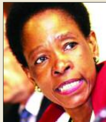
ANNA TIBAIJUKA – UN Habitat Director, Africa Commission member, Tanzania – Page 11