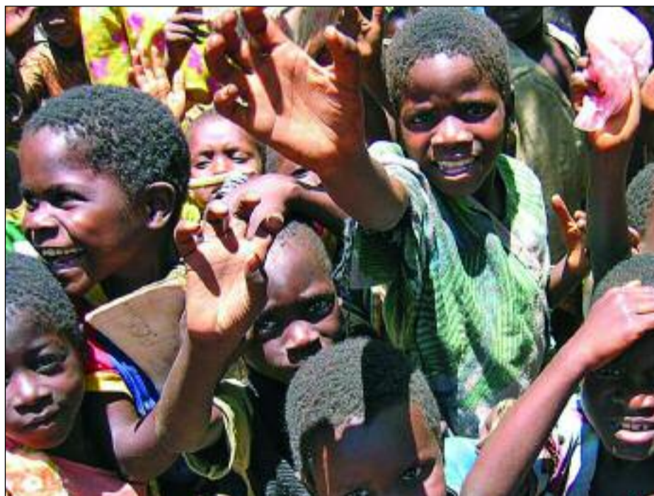
VSO teachers at this Malawi school help educate 9,500 kids.

James Gillespie's High School in Edinburgh has been piloting a new media educational tool that simulates the Rwandan genocide of 1994. "Pax Warrior" is the computer simulation that puts 16-year-old pupils in the role of a United Nations military commander who