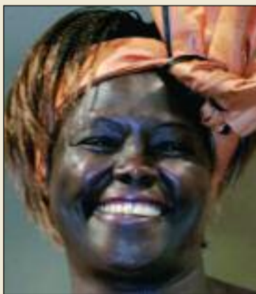
WANGARI MAATHI – Nobel Peace Prize Winner & Green Belt Movement founder, Kenya – Page 4