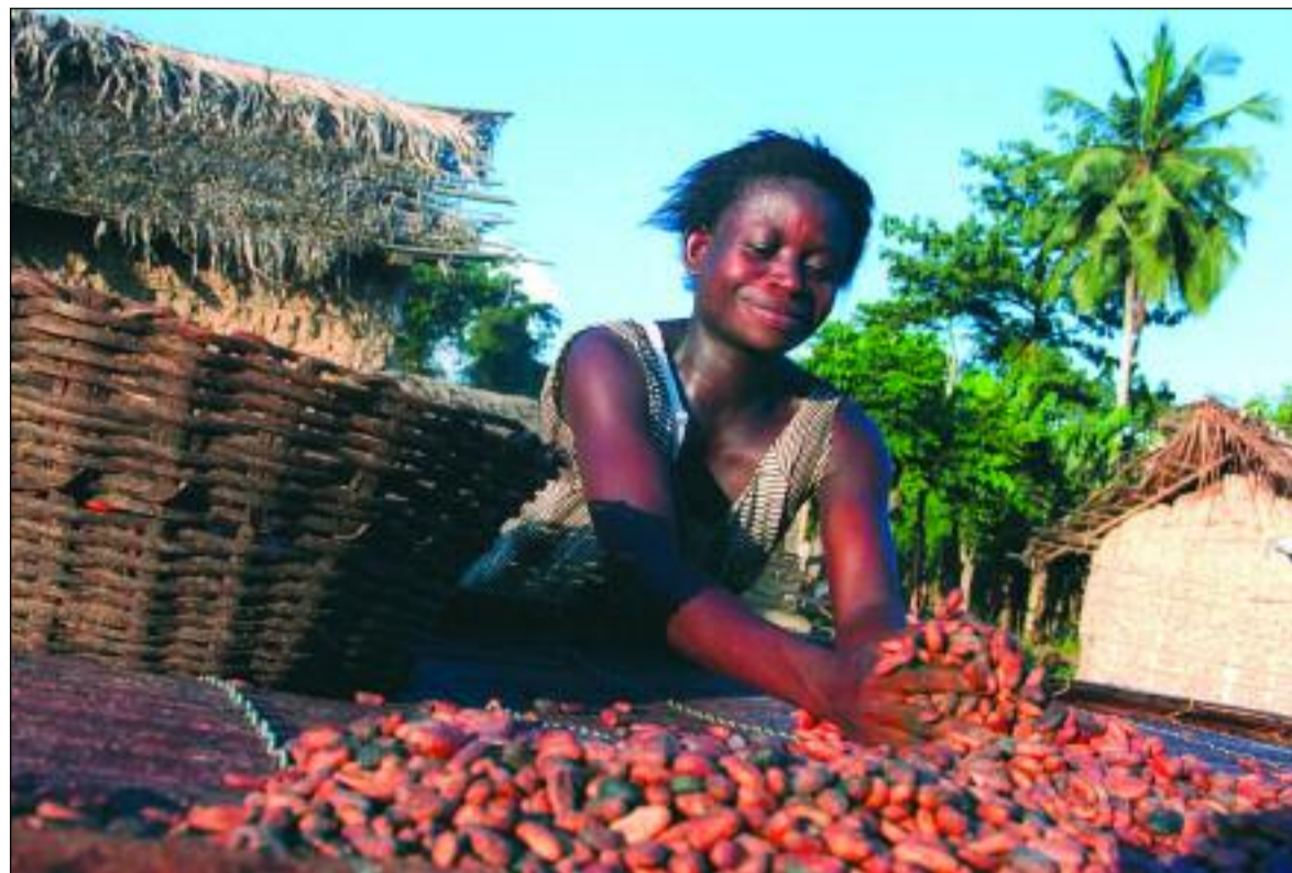
Drying the coffee. Even in co-ops women are often farmers but not owners.

The next big barrier to better sales was communication between the co-op management and farmer members on everything from market information to coffee quality. Members were ignorant of the business realities facing the co-op, and could be unrealistic and suspicious of management arguments. Equally, management was ig-