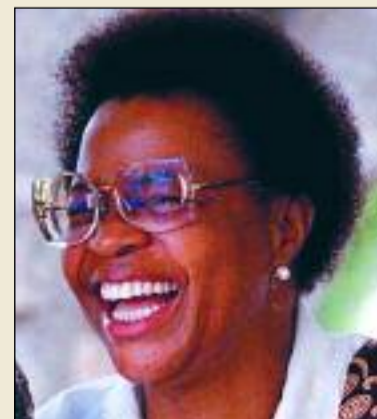
GRACA MACHEL – Kids campaigner, boss Capetown Uni, Nelson Mandela's wife, South Africa – Page 11